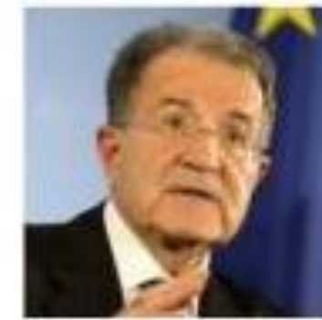
Romano Prodi President

EWEI also produces and distributes the geopolitical magazine "eastwest", since 2004 ( www.eastwest.eu ).