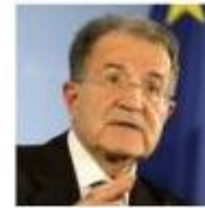
Romano Prodi President

EWEI also produces and distributes the geopolitical magazine “eastwest”, since 2004 ( www.eastwest.eu ).